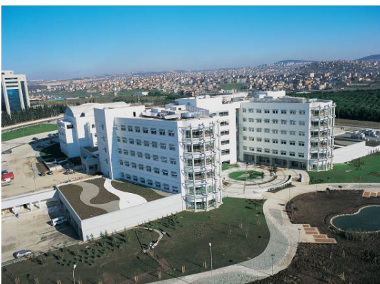
A birds view

Though the hospital possesses an “expensive” aura with beautiful use of materials, it still gives a businesslike impression. Privacy was taken into account carefully throughout the whole hospital by a division of patient flows and visitors.