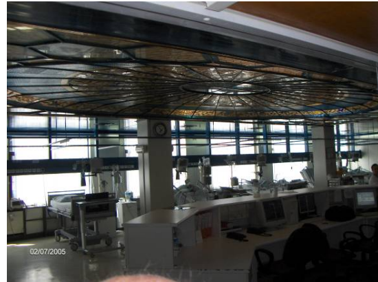
Ceiling Intensive care

The Anadolu Health Centre is a private hospital which has a strategic affiliation with the Johns Hopkins Medicine in the USA. The hospital, with 209 beds, has been delivered in February. Anadolu has the goal to become the best healthcare provider in Turkey, South Eurasia and the Middle East.